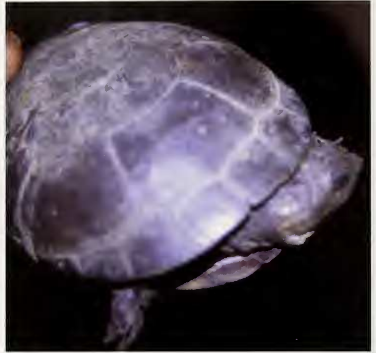
Fig. 7. Pelomedusa subrufa from near Bohicon, southern Benin.

gust/September 1984; ZFMK 77061-062, Bohicon, ZFMK 77063-064, Cotonou, all coll. by K. Ullenbruch, May/June 2002.